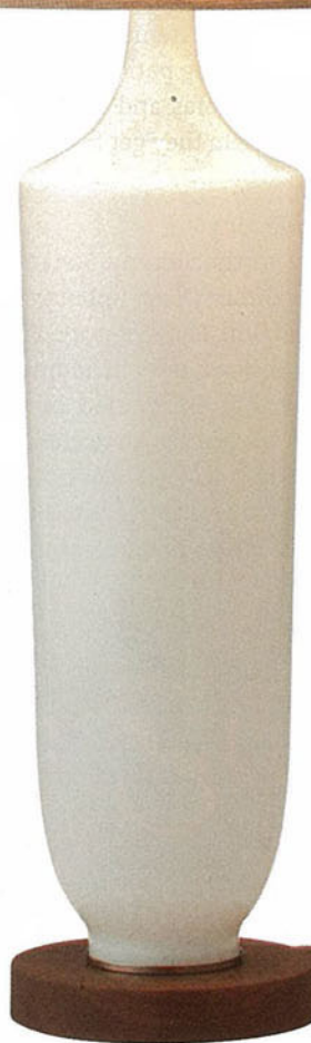
The Elizabeth Lamp from Schoolhouse Electric & Supply Co.